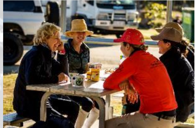
Equestrian creates a sense of community