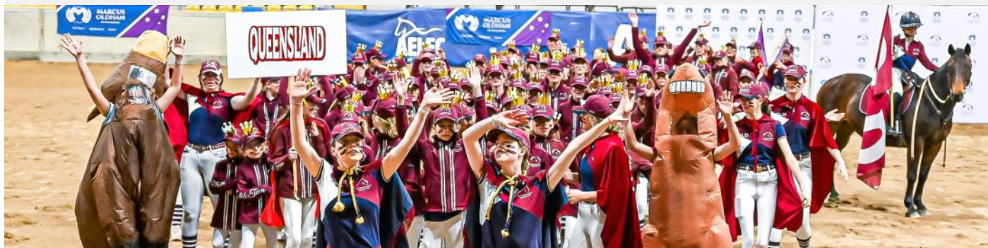
Pictured Below: 2024 Queensland Team at the Marcus Oldham Australian Interschool Championships