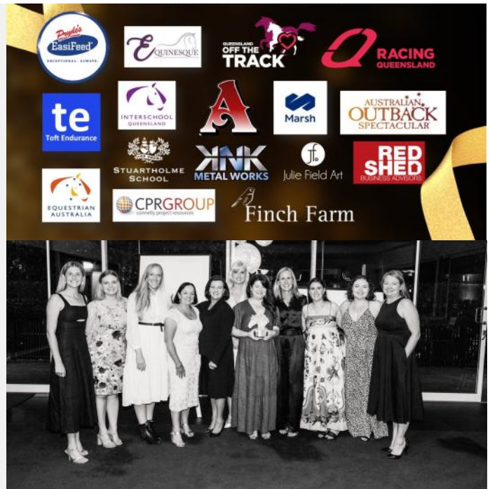
Pictured Above: CPR Group Club of the Year Winner Fig Tree Pocket Equestrian Club

The highlight of the evening was the presentation of the 14 major award categories, which recognised excellence across all facets of equestrianism. EQ extends a heartfelt thank-you to all the sponsors, partners, and volunteers who made the evening such a success. To all finalists and winners, congratulations on your outstanding achievements! Your contributions continue to inspire and elevate equestrian sport in Queensland.