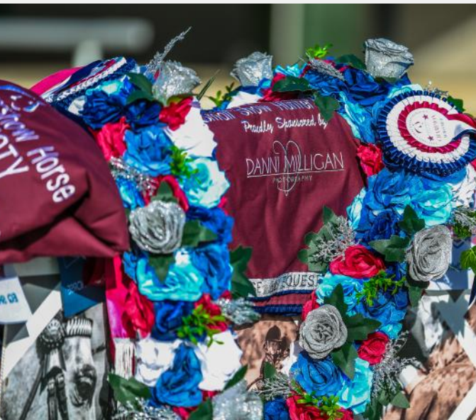
Pictured Below: 2024 Champion Awards