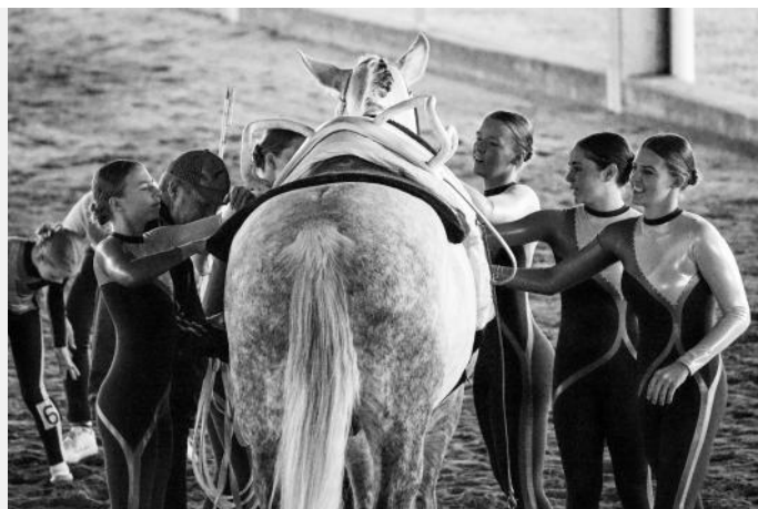
Pictured Above: Fassifern Vaulting Squad

At the end of September, Fassifern Vaulting organised the Australian National Vaulting Championship in Boonah, this event was supported by VQ and Equestrian Queensland. This allowed all Queensland vaulters to attend without the cost of travelling interstate.