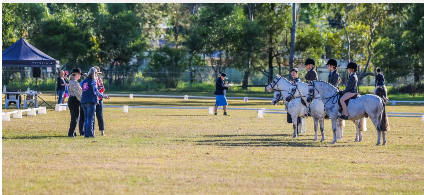
Pictured Below: 2024 Champions Choice Browbands and Garlands Child’s and Newcomer Horse of the Year

The year culminated of the of the revised 2024 Show Horse Queensland Leaderboard and the Sportspersons of the Year Awards were presented at the EQ Annual Awards evening.